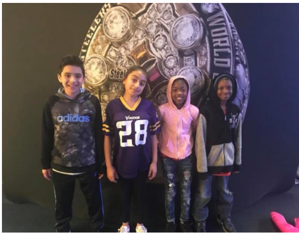
Some of our students enjoying the Super Bowl Live experience