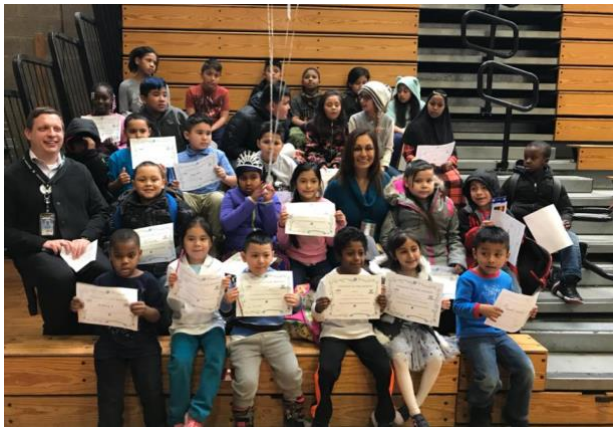
Green Central's students of the month