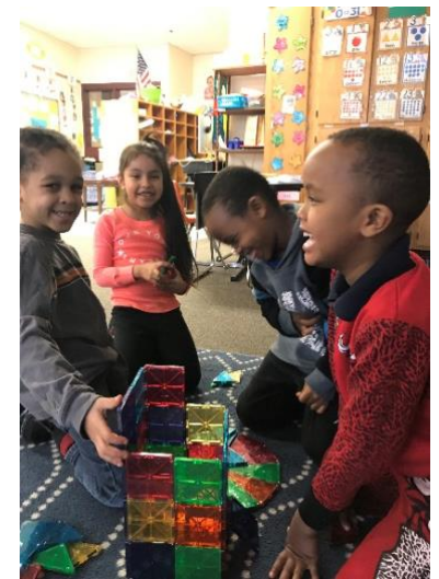
Kindergarten students enjoying learning with their classmates

Our building is a central hub for the community. At Green we strive to provide services and programs that meet the needs of our families and community. We currently provide after school youth programming, adult enrichment classes, and access to resources such as housing, health insurance, or food assistance.