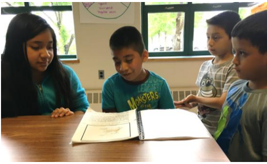
A 2 nd grade Dual Development Language (DDL) student presenting his insect book to his Green peers.