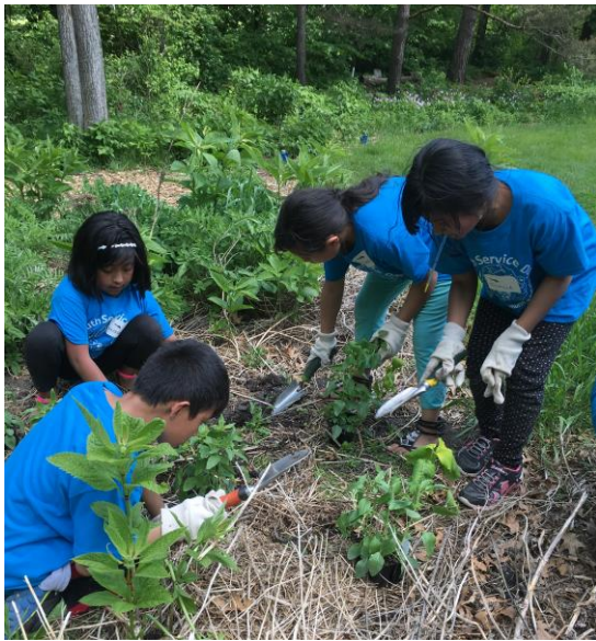
Green students planting a butterfly garden at Youth Service Day.