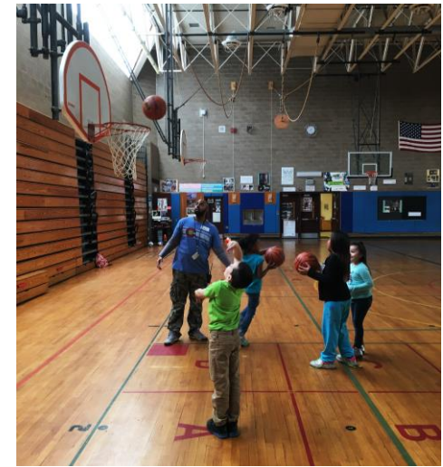
Playing basketball during Spring Break Session.

A full-service community school utilizes the school as a central hub for the community. At Green we strive to provide services and programs that meet the needs of our families and community. We currently provide after school youth programming, adult enrichment classes, and help getting access to resources such as housing, health insurance, or food assistance.